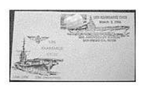
50th Anniversary 1st Day Cover Envelope $1.50