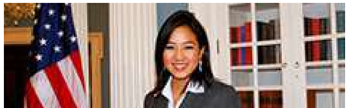
Figure skater Michelle Kwan, a 5 time World Champ and 2 time Olympic medalist, was appointed as the first American Public Diplomacy Envoy in Nov. 2006

President Gerald R. Ford signs a proclamation in 1976 confirming the termination of Executive Order 9066, which resulted in the incarceration of Japanese Americans during World War II.